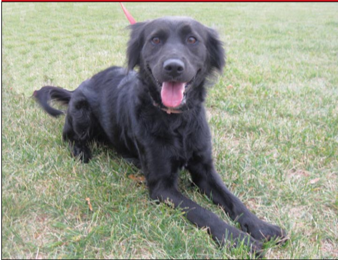
Above is a happy and healthy Maddie enjoying the fresh air outside at CHS.