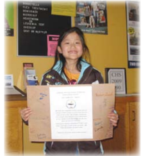
ABOVE: An Olympia Brown Church member holds the letter with signatures from all the children.