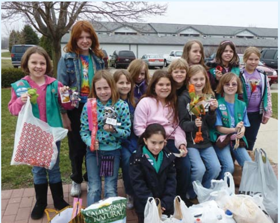
A group photo of Girl Scout Troop No. 5895 from the City of Racine.