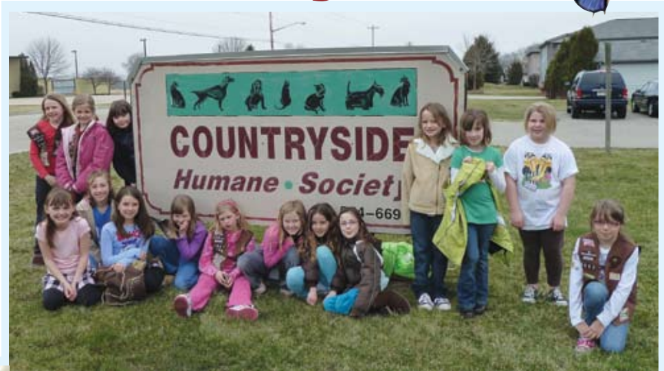
Pictured above is Girl Scout Troop No.5957 from Evergreen Elementary School, Waterford.

We would like to thank both groups and their troop leaders for their generous donations to our shelter. We really appreciate all the hard work and kindness to our animals.